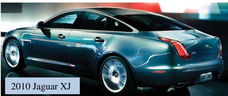
2010 Jaguar XJ

A school for homeless children and their families. It provides an opportunity for at-risk children to participate in a social learning environment where children can develop lifelong skills toward becoming emotionally secure people.