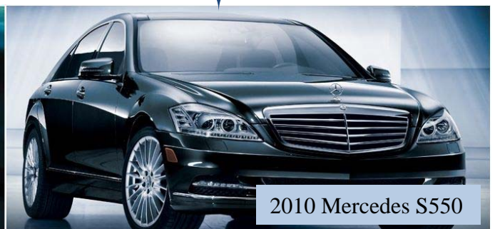
2010 Mercedes S550