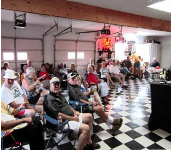
Central & Eastern Oklahoma Sections