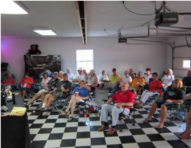
The Motely Crew from both Oklahoma Sections