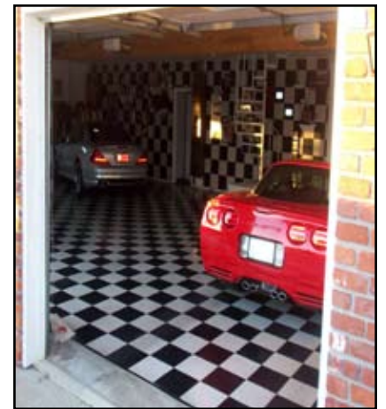
Oops...they hid the corvet!